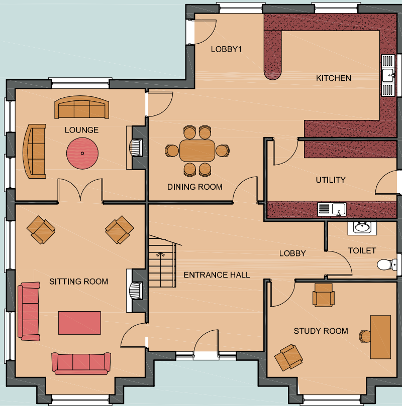
Ground Floor Plan - Area - 144.10sq.mt.1551.08sq.ft.