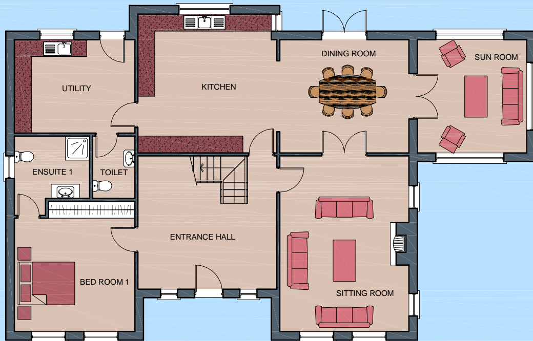
Ground Floor Plan - Area - 150.82sq.mt.1623.41sq.ft.