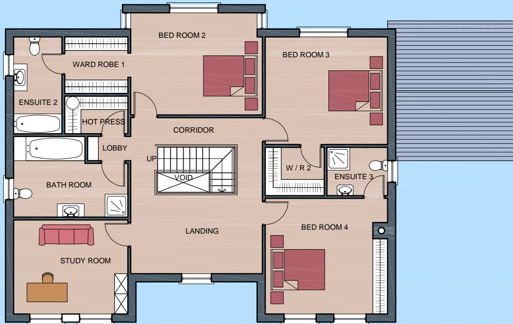
First Floor Plan - Area - 129.67sq.mt.1395.76sq.ft.