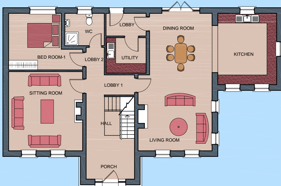
Ground Floor Plan - Area - 122.08sq.mt.1314.06sq.ft.