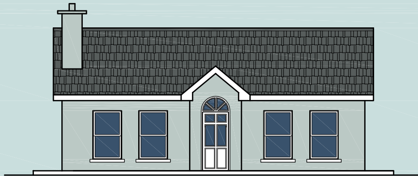
Front Side Elevation