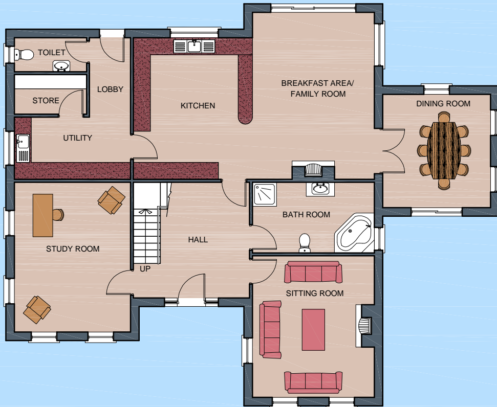
Ground Floor Plan - Area - 150.64sq.mt.1621.48sq.ft.