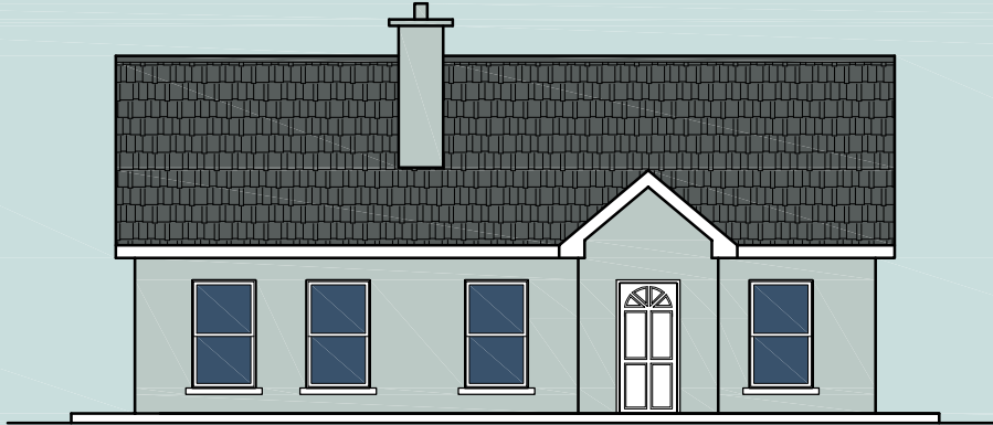
Front Side Elevation