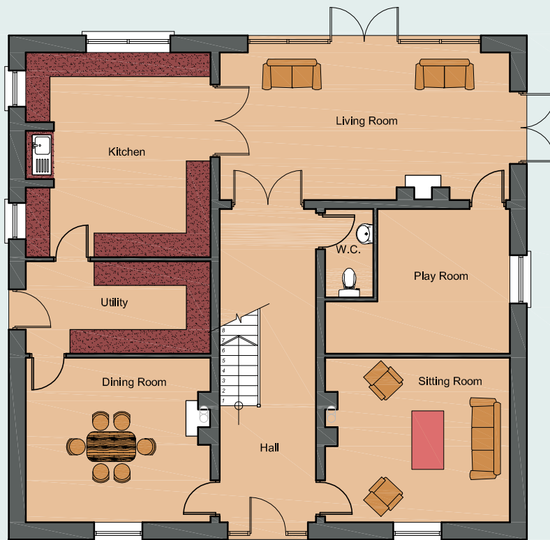
Ground Floor Plan - Area - 133.24sq.mt.1434.18sq.ft.