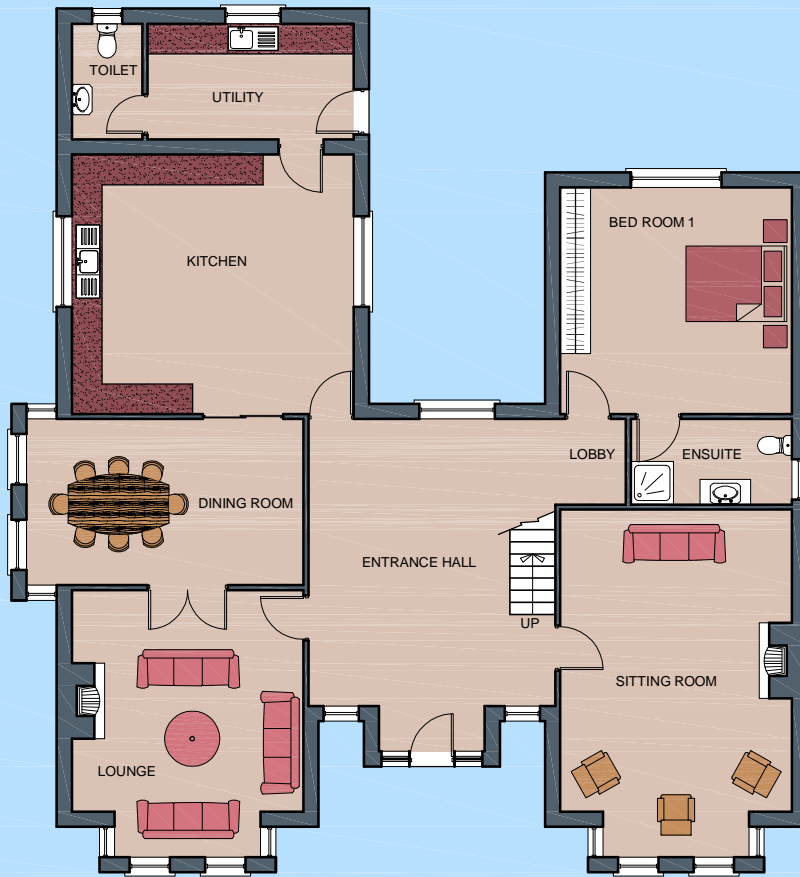
Ground Floor Plan - Area - 169.69sq.mt.1826.53sq.ft.